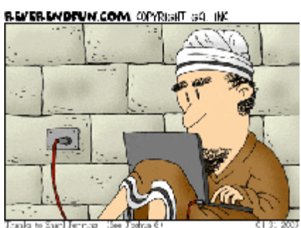
Totals to Sacriffernia (See Folga 6) USING TRUMPETWARE I.O., JOSHUA ATTEMPTS TO HACK THE FIREWALL OF JERICHO