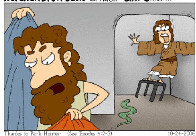
ZIPPORAH, HONEY, HAVE YOU SEEN MY STAFF?