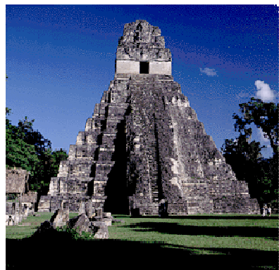
Mayan Ziggarat - Tikal Temple I and the Great Plaza